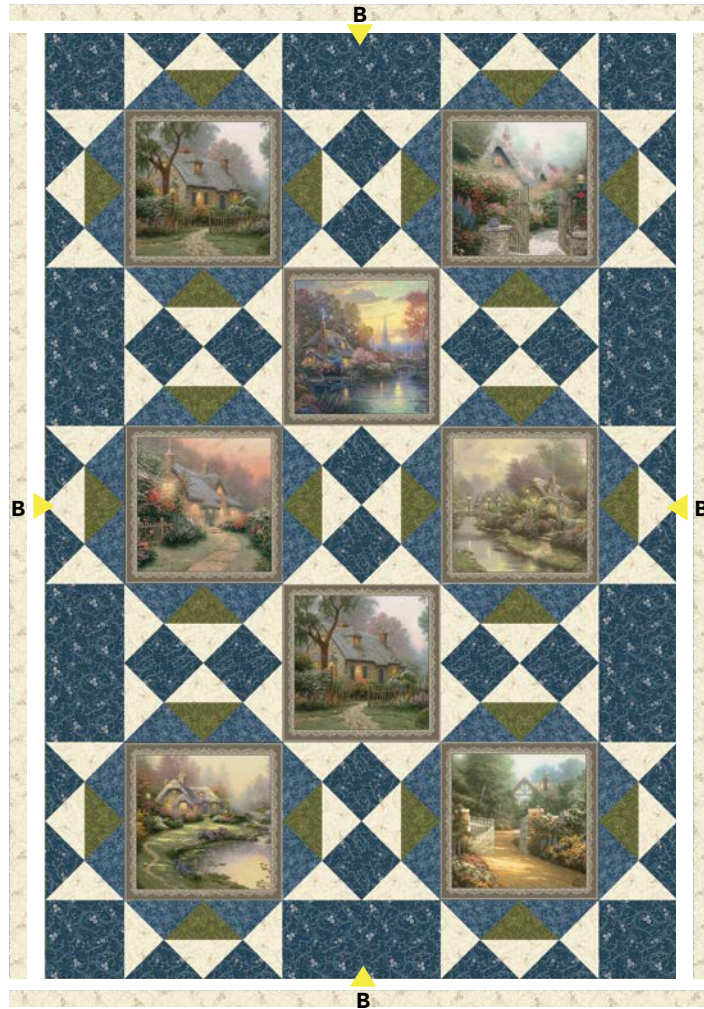
Finished Quilt Size 36" x 54"

FINISHING: Cut batting and backing 3" larger than top on all sides. Layer backing, batting and top together and baste or pin. When quilting is completed, trim excess batting and backing. Bind with D fabric.