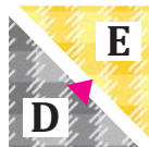
DE Block (Make 12)

BORDER ASSEMBLY MEASURE WIDTH AND LENGTH OF THE QUILT TOP TO ENSURE BORDER SIZES, BELOW ARE OUR CUTTING SIZES.