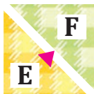
EF Block (Make 12)