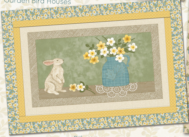
Fresh Cut Flowers Pillow