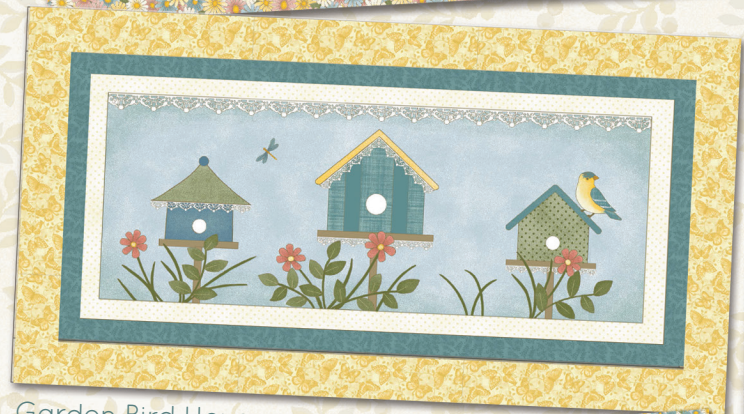
Garden Bird Houses