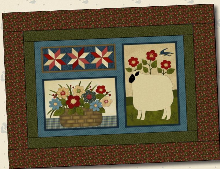
Sheep's In The Meadow Wall Hanging Finished Size: 20" x 27"