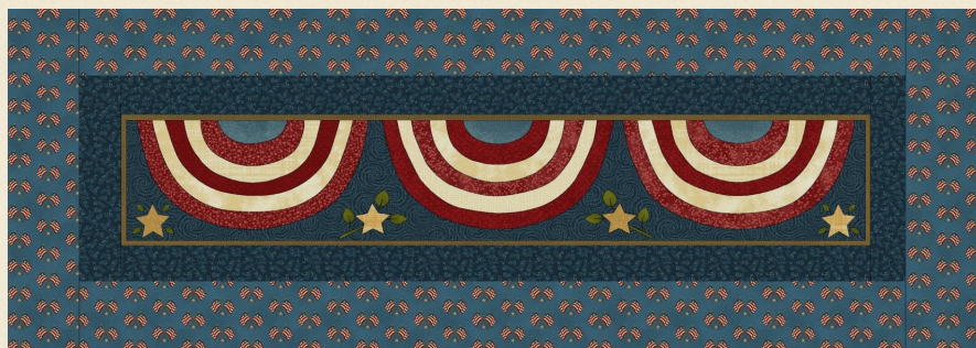
Swag Table Mat/Runner Finished Size: 10" x 25"