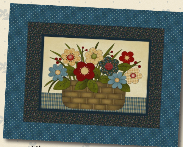
Liberty Hill Basket Pillow