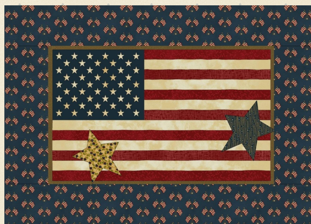
Folk Art Flag Pillow Finished Size: 11" x 14"