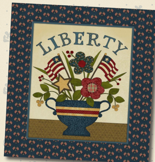
Liberty Hill Wall Hanging